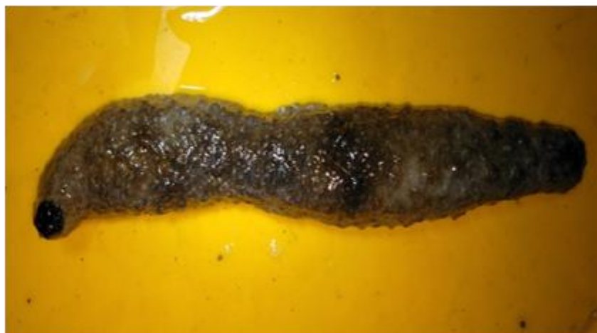
Figure 7. Holothuria arenicola (Semper 1868).

Diagnostic features. Normally tan with large brown blotches on the dorsal surface. Ventral surface is white to cream color. Bohadschia marmorata is a small to moderate-sized species with a cylindrical body, flattened ventrally and tapering at both ends. It has a very slippery texture. The ventral surface is with long slender podia, prominent on the lateral margins. The anus is large and nearly dorsal. Juveniles are light olive green with darker green blotches, which camouflage them in seagrass beds. It may or may not readily eject cuvierian tubules, depending on the region (Purcell et al 2012).