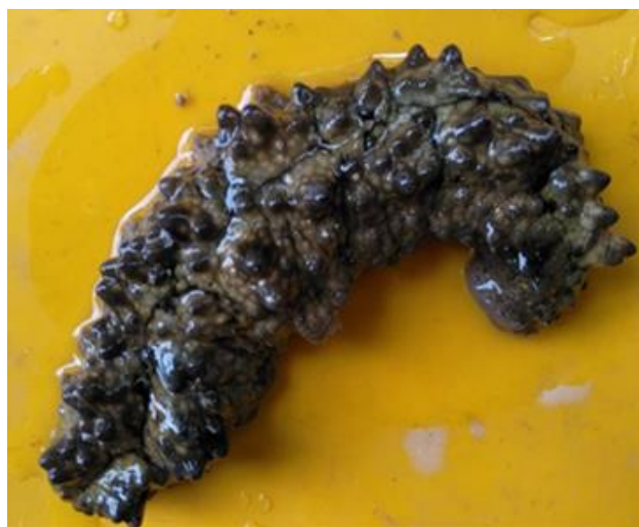
Figure 2. Stichopus horrens Selenka 1867.