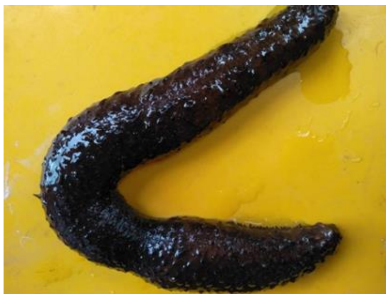
Figure 5. Holothuria leucospilota (Brandt 1835).

Diagnostic features. Uniformly black and body is commonly covered with medium-grain sand, with characteristic bare circles in two rows along the dorsal surface. Tentacles are black. The anus is terminal, without teeth or papillae. Cuvierian tubules are absent. This species can also be distinguished by the reddish dye released from its body wall when rubbed (Purcell et al 2012).