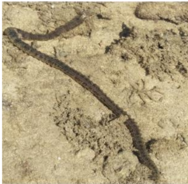
Figure 8. Synapta maculate .

Diagnostic features. Their coloration is cream to rusty tan. Some individuals are quite orange, becoming whitish towards either the mouth or anus. The ventral surface is yellowish-white with two rows of relatively large, dark brown, spots. Holothuria arenicola is a small species. The body wall is relatively thin but is very rough to the touch. It has no cuvierian tubules (Purcell et al 2012).