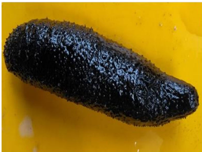
Figure 4. Holothuria atra (Jaeger 1833).

Diagnostic features. In the Pacific Ocean and Southeast Asia, it can be black to grey or light brownish green, sometimes with greyish-black transverse lines. In the Indian Ocean, it is usually dark grey with white, beige or yellow transverse stripes. The ventral surface is white or light grey with fine, dark spots. The body is oval; arched dorsally and moderately flattened ventrally. The dorsal surface has deep (3 mm) wrinkles and short (1.5 mm) papillae. The body is often covered by fine muddy-sand. The mouth is ventral with 20 small, greyish, tentacles. The anus is terminal with no teeth and no Cuvierian tubules (Purcell et al 2012).