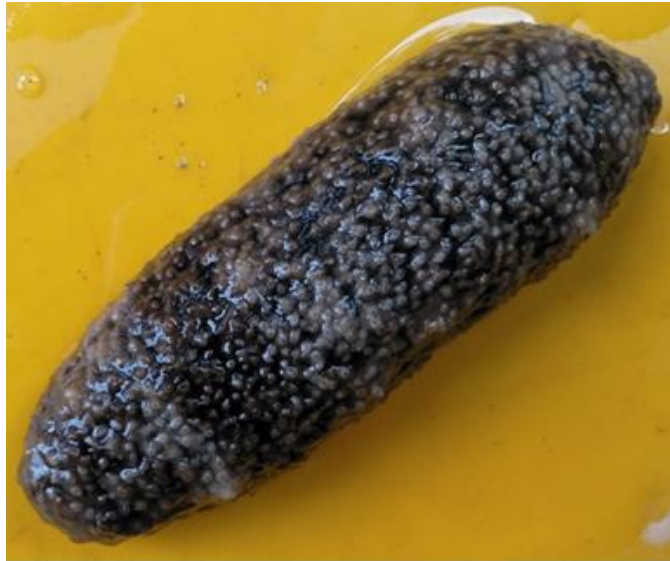
Figure 3. Holothuria scabra (Jaeger 1833).

Kingdom: Animalia Phylum: Echinodermata Class: Holothuroidea Order: Aspirochirotida Family: Holothuridae Genus: Holothuria Species: scabra English name: Golden sandfish Local name: kaki