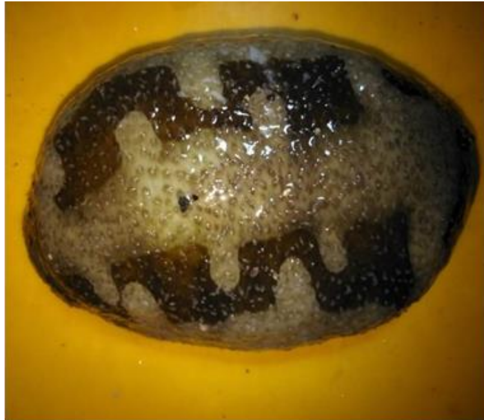
Figure 6. Bohadschia marmorata (Jaeger, 1833).