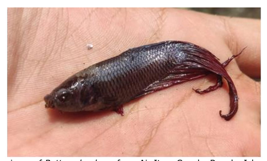
Figure 1. Specimen of Betta splendens , from Air Itam Canals, Bangka Island, Indonesia.

New records . In this research, we report the first record of Betta splendens from Air Itam Canals, Bangka Island, Indonesia (2°13′92″S, 106°15′33″E). We discovered ten specimens like the one in Figure 1. B. splendens is originated from the Mekong River, Thailand (Tan & Ng 2005) and it has been introduced into the natural water of the Bangka Island, as a non-native species.