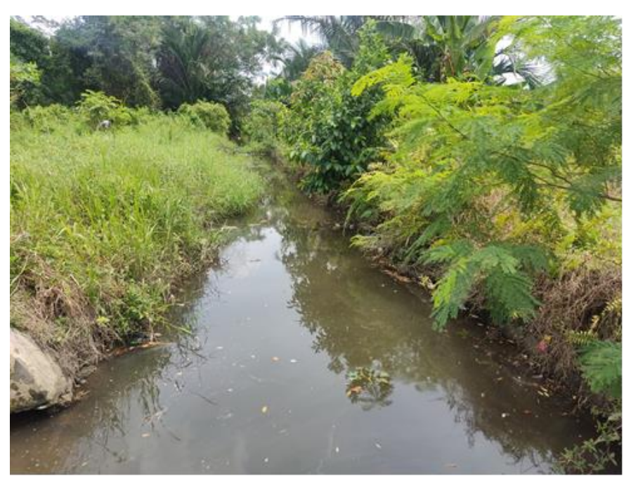
Figure 3. Habitat of Betta splendens in Air Itam Canals, Bangka Island, Indonesia.

Betta edithae, Channa striata, Hamirhampodon pogonatus, Macrobrachium sp., and Parathelphusa maculata, were also present at the time of sampling.