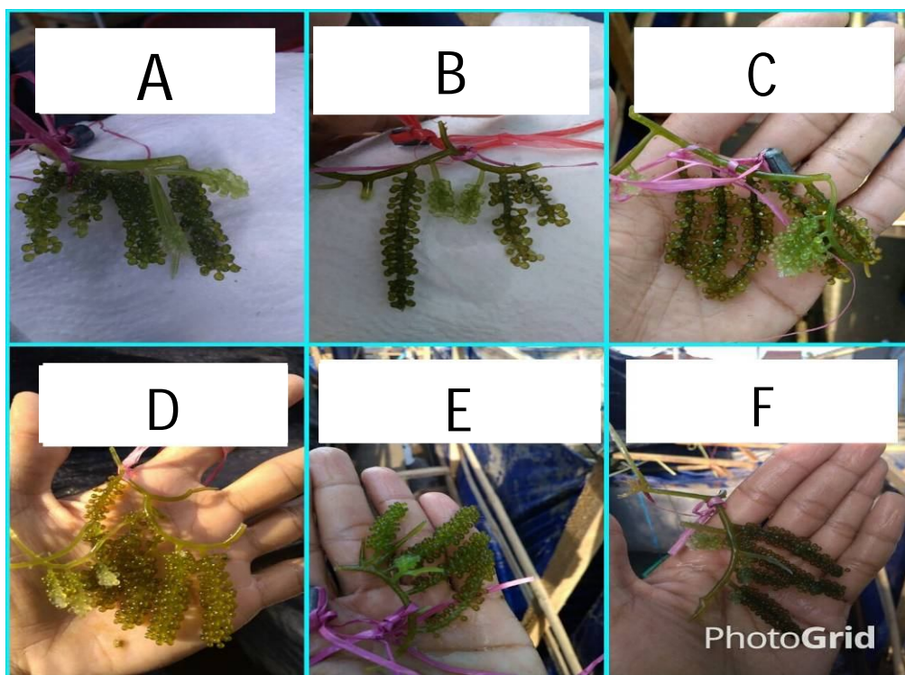
Figure 1. The growth of new thallus of C. racemosa . The above figures show the Caulerpa racemosa thallus obtained from each treatment group A-F = treatment groups).

From the Table 1 above, it can be seen that the growth rate and biomass in general experience an increase from the initial weight and this occurred in all treatments. The highest value was found in treatment B. Nonetheless, statistically, the vermicompost treatment dose did not give significant differences in term of growth rate. There was a difference between groups of treatment in the initial weight and at the end of the rearing period (Figure 1).