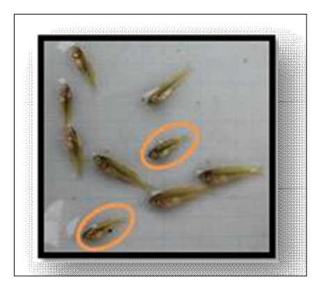
Figure 2. Fourty days old red rainbowfish. Balloon red rainbow circled and normal red rainbow not circled.

Average total length, standard length, body height and weight of 5 months old normal and balloon fry rainbowfish produced from mating combination treatment is presented in Table 4. The total length of normal red rainbowfish was in range of 4.55-5.52 cm, longer than balloon which was in range of 3.63-3.91 cm. Meanwhile, the height was almost similar between balloon and normal red rainbowfish ranging from 1.12 to 1.151 cm and 1.14 to 1.55 cm respectively. The weight of normal rainbowfish was in range of 1.04-1.99 g, heavier than that balloon of 0.84-1.44 g.