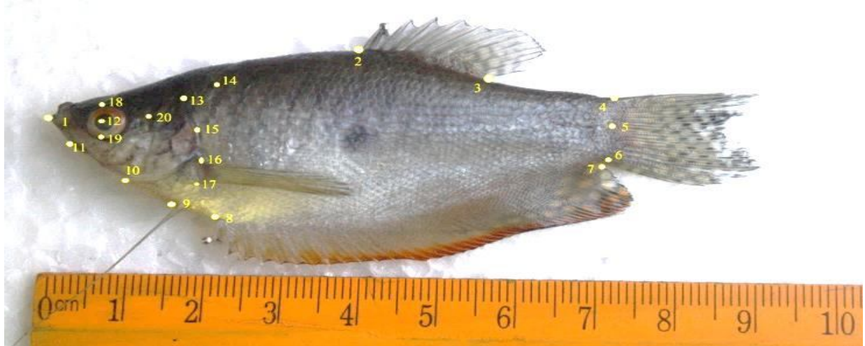
Figure 3. Landmarks used for digitizing image of Three-spotted Gourami, Trichopodus trichopterus : (1) snout tip; (2) & (3) anterior and posterior insertion of the dorsal fin; (4) & (6) points of maximum curvature of the peduncle; (5) posterior body extremity (7) & (8) posterior and anterior insertion of the anal fin; (9) insertion of the pelvic fin; (10) insertion of the operculum at the lateral profile; (11) posterior extremity of premaxillar;

Digitization of fish specimen and landmarking. Digital imaging of fish samples was done using Sony digicam (14 megapixels). Both left and right lateral sides were taken. Captured images were then converted to TPS format files using tpsDig version 2.10 program. Analyses of landmarks were obtained using Thin-Plate Spline (TPS) series to incorporate curving features within the image. A total of 20 landmark points (equivalent to 20 X and 20 Y Cartesian coordinates) were selected following landmarks used by Dorado et al (2012) to best represent the external shape of the body. Location and description of landmark points is shown in Figure 3.