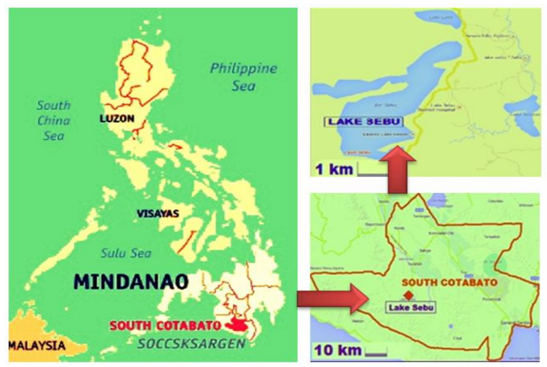
Figure 1. Map of the Philippines showing South Cotabato located in Mindanao (lower right) and an aerial view of Lake Sebu (upper right).