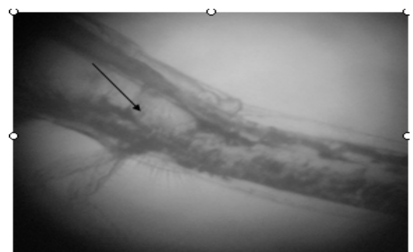
Figure 3. Swollen hindgut syndrome affected post larvae of P. monodon (Magnification 10X).

However, this problem does not show the mass mortality of P. monodon larvae like WSSV disease. It has negative effects on digestion and excretion and significantly reduced the production of PL. The causes of this syndrome are not known, but the present study found two gramnegative bacteria was responsible for this syndrome. Two species of Vibrio were isolated from the affected PL, identified as Vibrio alginolyticus and Vibrio harveyi (Table 1). Among these V. alginolyticus was dominant to V. harveyi . Lightner (1996) reported that V. alginolyticus is very common in the marine environment. Uma et al (2008) found V. harveyi, V. alginolyticus and Vibrio campbellii (Baumann, Baumann and Mandel 1971) in swollen hindgut affected post larvae in India. Karunasagar (1994) reported that mass mortalities of P. monodon associated with Vibrio spp. have been observed in shrimp hatcheries in India. Lavilla-Pitogo et al (1990) reported that larval prawns are particularly susceptible to V. harveyi . Nash et al (1992) reported that pathogenic strains of V. harveyi, Vibrio vulnificus (Reichelt, Baumann and Baumann 1979), Vibrio parahaemolyticus (Fujino, Okuno, Nakada, Aoyama, Fukai, Mukai and Ucho 1951) have caused massive epidemics in Thailand. Baumann & Baumann (1981) reported that V. alginolyticus is very common in coastal waters of temperate and tropical regions. Nash et al (1992) reported that V. alginolyticus is to be pathogen for P. monodon larvae.