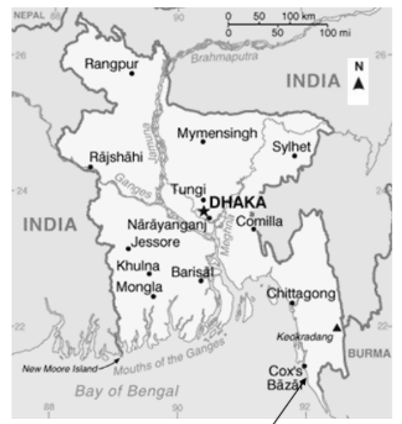
Figure 1. Map showing sampling area of Kolatoly hatchery zone, Cox's Bazar.