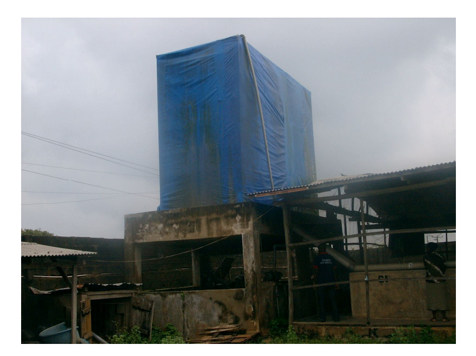
Fig. 4. External view of a Water Recirculation Aquaculture System (WRS) facility.