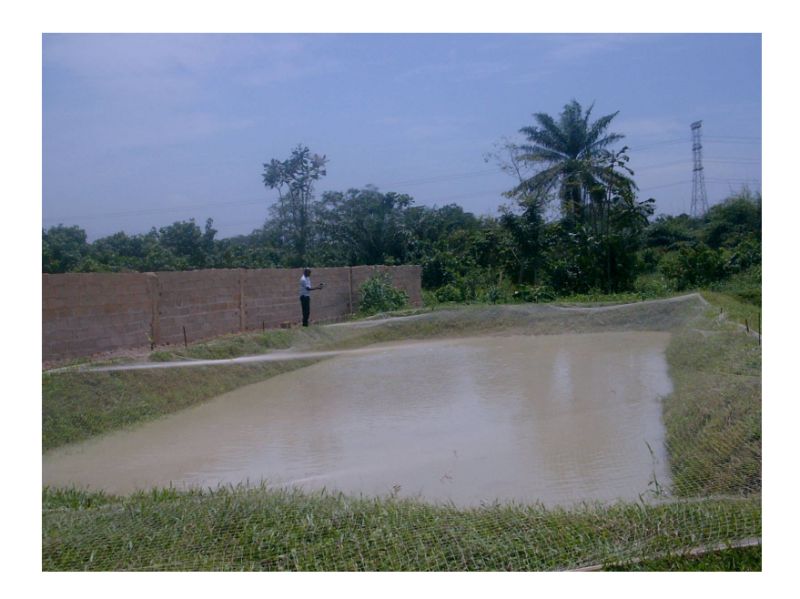
Figure 2. An earthen fish pond located in the Fish Farm Estate stocked with juveniles.