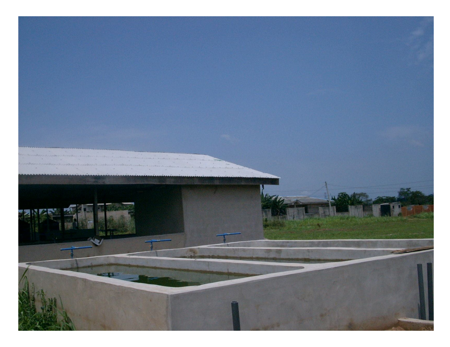
Fig. 3. A flow-through concrete tank for growing the African catfish, Clarias gariepinus .

The establishment of a fish farm estate in a suburb has intensified emphasis on fish culture in the state. Small-scale fish farming in Africa has the potential to produce a substantial amount of the fish requirements, to increase income, diversify livelihood options, reduce vulnerability and improve water and land management in rural areas and urban centers (Dugan 2003). The actual contribution of small-scale initiatives is probably underestimated in terms of volume and economic value because most abound as homestead/family operated ventures. Nevertheless, profit is a strong motivating force for those engaged in aquaculture; more products are produced for sale in the growing markets and fewer are retained for household consumption (Oguntade et al 2006). Thus, commercial aquaculture as practiced on this basis can best be described as being of a