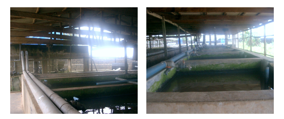
Fig. 5a & 5b. Interior of WRS facility for growing the African catfish, C. gariepinus in concrete tanks.

Nationwide there are about 59 Government-owned fish farms most of which are moribund. Some of these could be readily converted to brood stock repositories in the country to provide certified farmed fish stocks of known origin. Besides serving as centers for the production of certified broodstock, these rehabilitated farms should also have well - equipped fish health laboratories for strict quarantine measures and to assist farmers in the diagnosis and treatment of fish diseases and parasites. This step would facilitate human capacity building in fish health management, an area not well understood and with a handful of specialists in the country.